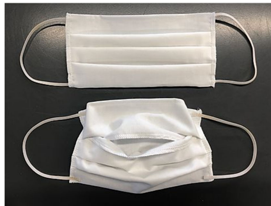
Face Mask with Filter Pocket & Elastic