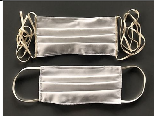
Standard Face Mask with Twill or Elastic